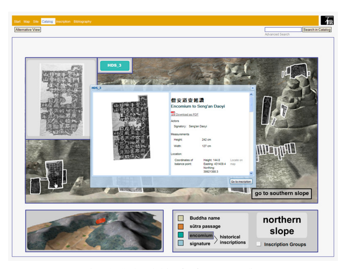
Figure 4 – Catalog: Flash interface for Mount Hongding

Each site is introduced in terms of space, time and inscriptions. The section on "space" defines the location of the site, describes its characteristic topography, the grouping of inscriptions and elucidates on the place name. In the "time" section a site is placed in the context of Buddhist history and history in general, discussing its dating, or its relations to monasteries and historic figures. In the section on "inscriptions" the inscribed texts are divided in groups based on content and shape. They are positioned within the Buddhist transmission, compared with other versions, and conclusions are drawn upon text history. Finally, they are analyzed with focus on art historical characteristics, like engraving techniques and style of calligraphy. This scientific discussion is supplemented by images, video sequences and sometimes animations.