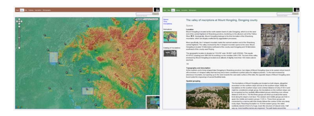
Figure 2 – Map interface