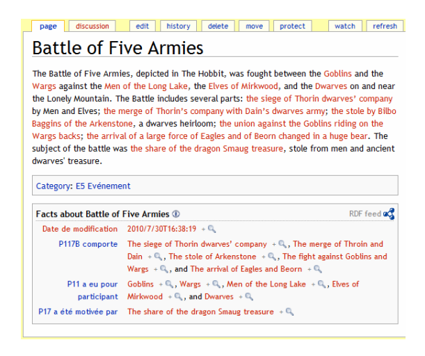
Figure 5. Semantic version of the Battle of Five Armies

Temporal entities (especially Events and subclasses) are intended to be a kind of key ring that holds different entities together. Most of these entities are persistent entities (sometimes called endurants). These are a few properties allowing two persistent entities to be linked together; thus usually requires using an Event - that is a temporal entity by nature. For instance, linking a 'thing' such as the book 'The Hobbit' with its creator requires creating the Event 'The writing of The Hobbit'. The important task of the annotator is to carefully choose the class of this temporal entity, related to the nature of persistent entities that are tight with this 'key ring', e.g. an E65 Creation for the creation of conceptual objects, E12 Production for the creation of physical manmade things, E67 Birth for the birth of a human being, etc. Once the nature of the temporal entity has been chosen, precise properties such as P96B gave birth or P97B was father to , can be used to relate persistent entities together. More general temporal entities such as E63 Beginning of existence and E64 End of existence may be used for temporal reasoning about 'things'.